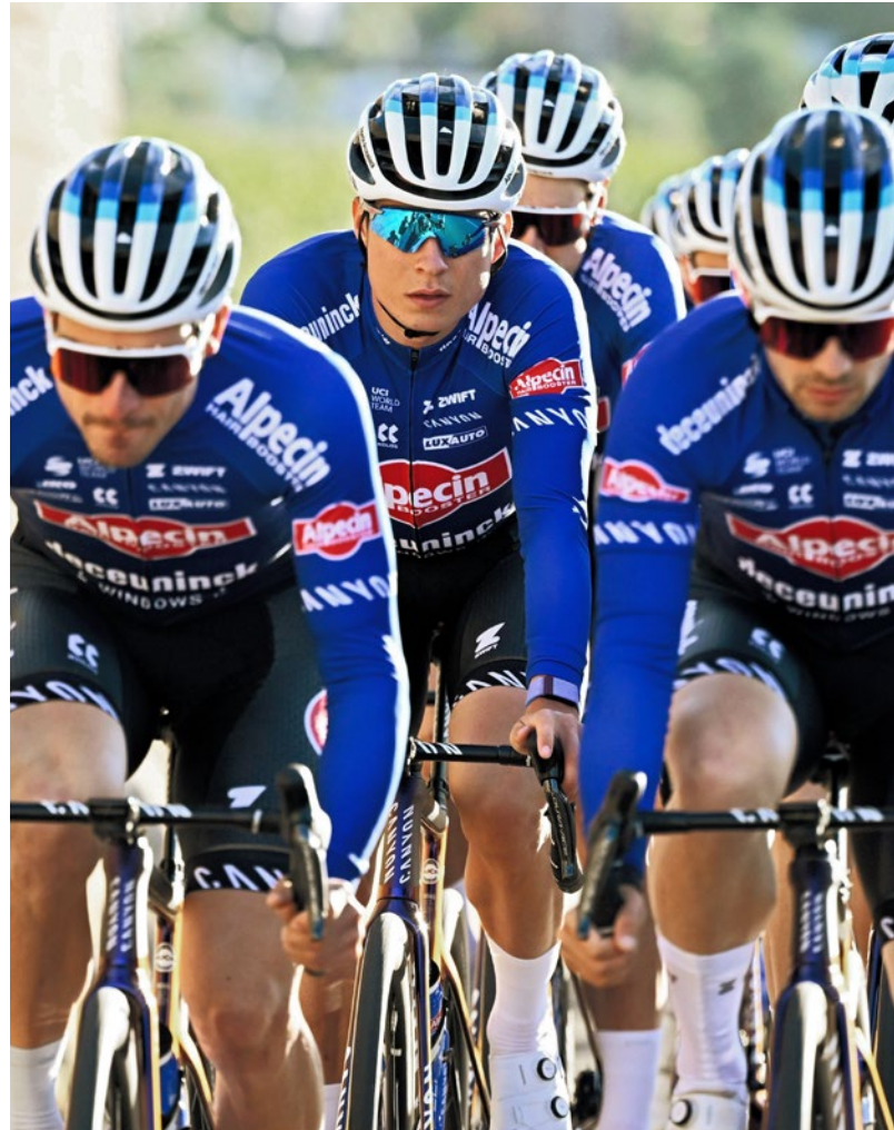
LONG SLEEVE JERSEYS

When the temperature drops, a long sleeve jersey can be the ideal alternative to ensure you maintain a comfortable temperature on your rides. From our PRO and ELITE collections, these close-fitting jerseys are made from insulated and elastic fabrics with brushed fibres on the inside for extra warmth and comfort. In the OFF-ROAD section you will find options for BMX, MTB and gravel riding.