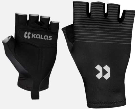
UNI n70532-UP01 (Regular) n70531-UP17 (Aerodynamic)