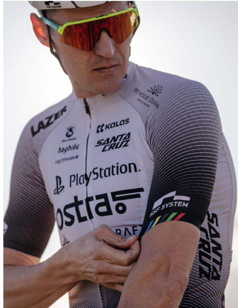
SHORT SLEEVE JERSEYS

Our most selling item is the short sleeve jersey. Choose from several alternatives in each of our collections with many options for different patterns and fabrics. With these different jerseys you are sure to find the perfect solution for your needs.